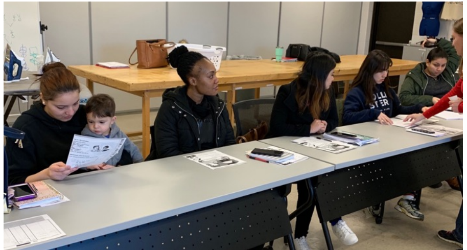
Fort Drum ESL students hard at work.

We are looking forward to a fun month ahead and we have a fun class lunch planned to celebrate St. Patrick's Day!